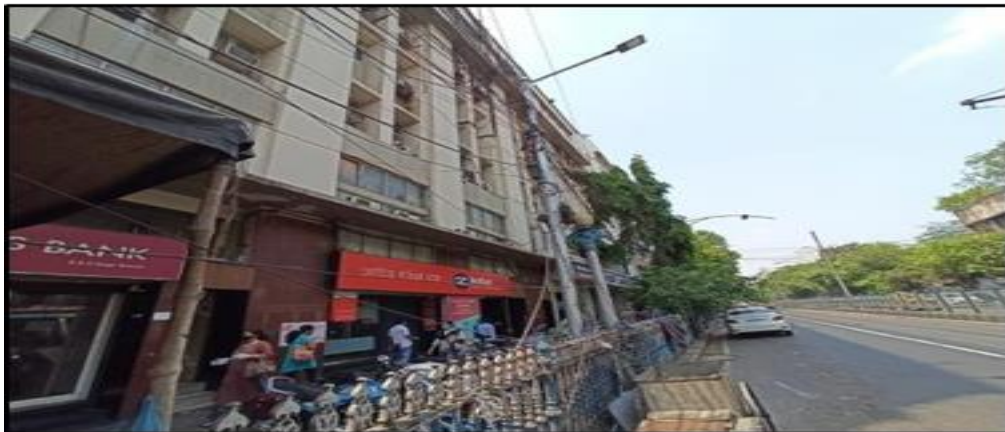
External view of subject property