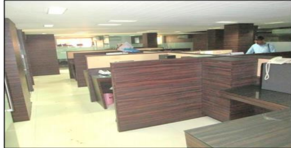
Internal view of Work Station