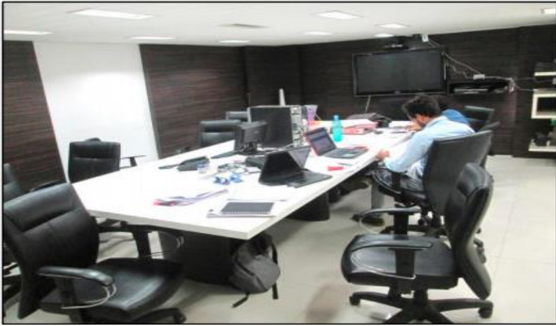
Internal view of the Conference room