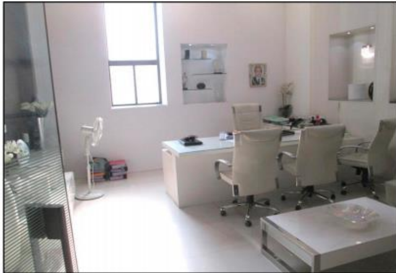
Internal view of M/D. Office